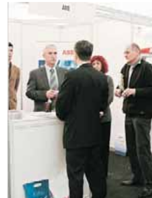
ABB is a global leader in power and automation technologies that enable utility and industry customers to improve their performance while lowering environmental impact. The ABB Group of companies operates in around 100 countries and employs about 109,000 people.

Phone: +47 22 87 2000 Fax: +47 66843549 Web site: www.abb.com